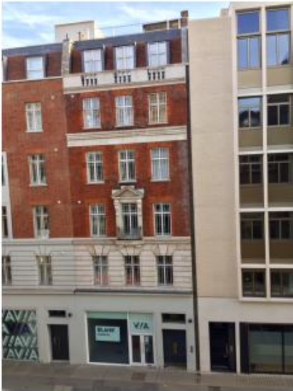
89 Great Portland Street residential building with 18 flats and single glazing opposite the premises